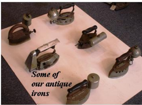
Some of our antique irons