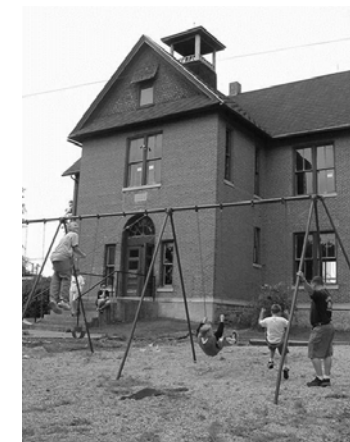
Playground at old school will be available for children at the Memorial Day picnic.