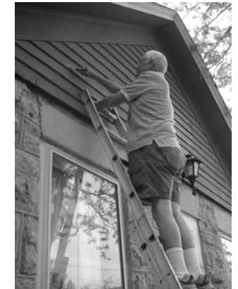
Harlan prepares new sign.