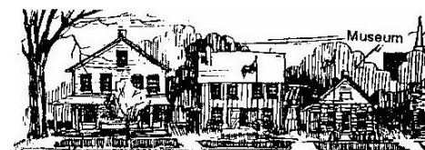
Cedarville Area Historical Society