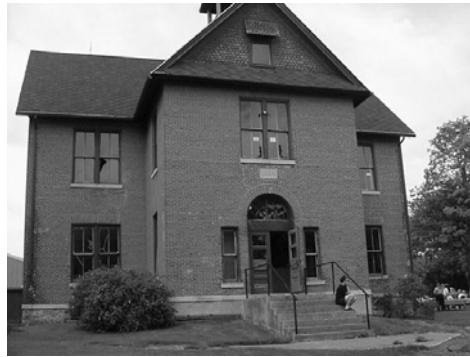
1889 Cedarville School

seum and meeting place for historical society members. Only the first floor will be utilized in the immediate future. Currently the society uses the nineteenth century village jail on Cherry Street as a museum. Because the building is filled with artifacts, documents and displays, there is not even enough room to hold meetings for the nine member board.