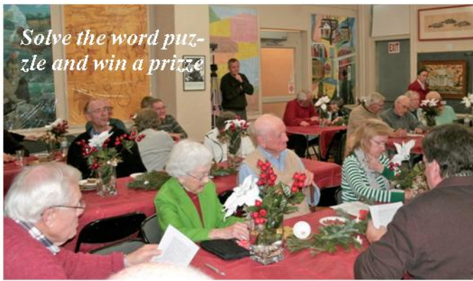
Solve the word puzzle and win a prize