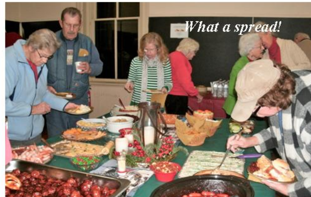
What a spread!