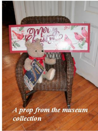
A prop from the museum collection