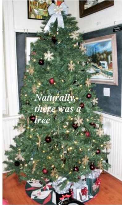
Naturally, there was a tree