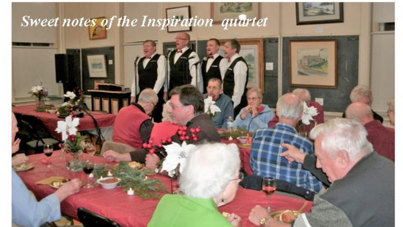
Sweet notes of the Inspiration quartet