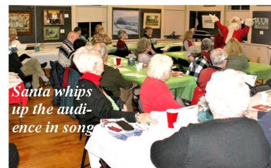
Santa whips up the audi- ence in song