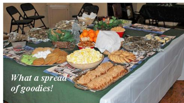
What a spread of goodies!