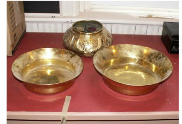
Brass ware that was made in Hull-House. Artist is unknown.