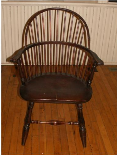
Left: Windsor chair from Cedarville homestead