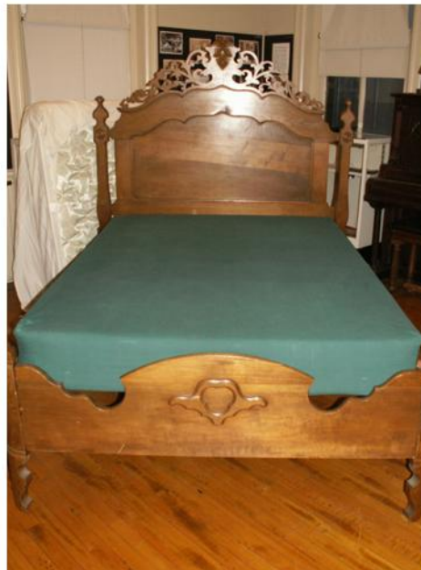
Right: Generally considered to be the Jane Addams birth bed