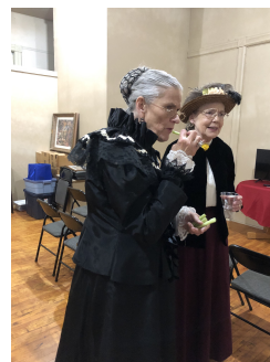
Jane Addams and Susan B. Anthony enjoy the refreshments and conversation