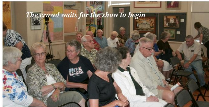
The crowd waits for the show to begin