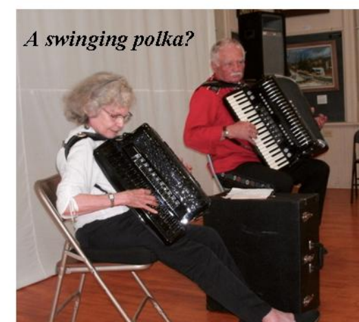
A swinging polka?