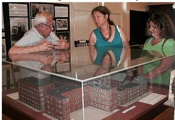
A chance to view a model of the Hull-House complex at its greatest expansion.