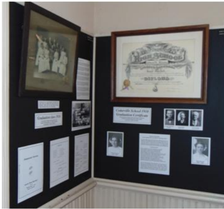
The northeast corner of the museum sports the new exhibit on the 1910 Cedarville graduation class and the 1909 full size bust of President Abraham Lincoln.