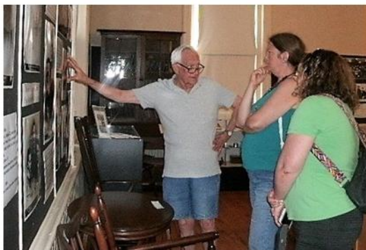
Wall of chronological photos tells the story of the public life of Miss Addams.