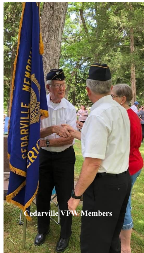
Cedarville VFW Members