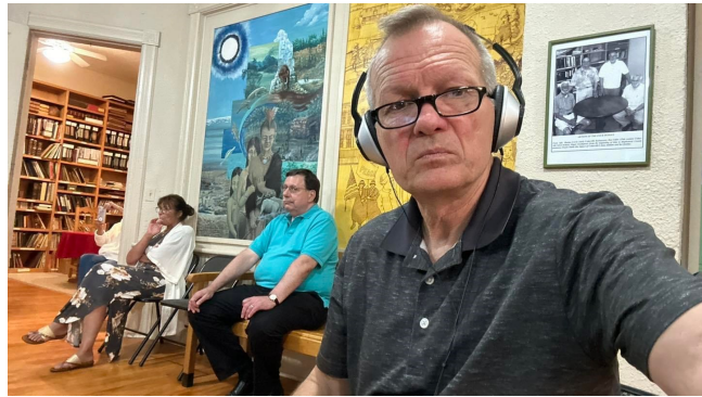
Making the program available on Facebook