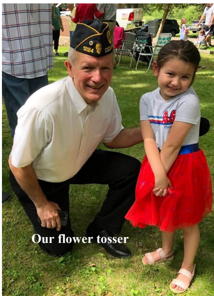
Our flower tosser