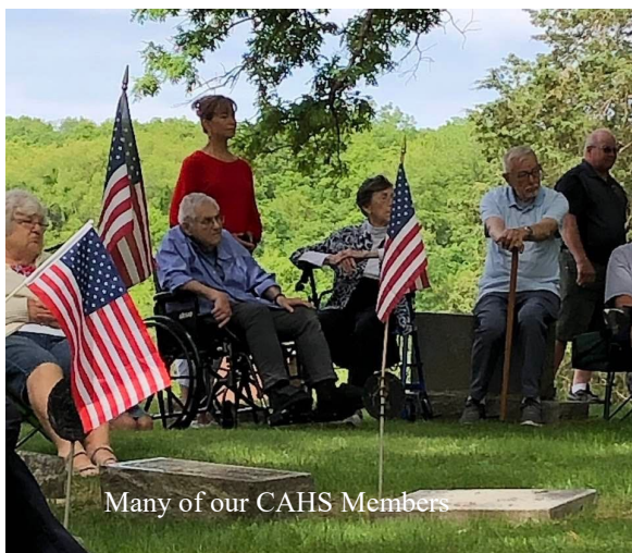
Many of our CAHS Members