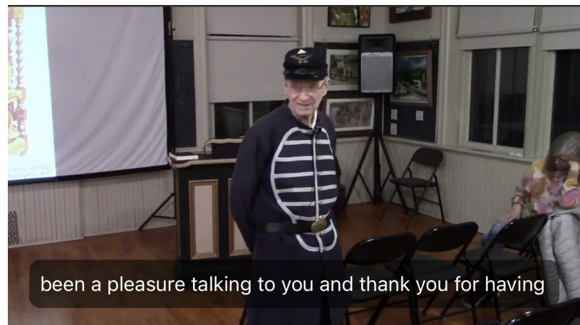
Don shares his program on African Americans role in the Civil War